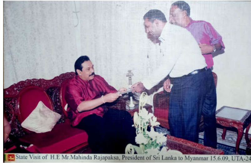
Greeting with President of Sri Lanka Mr.Mahinda Rajapaksa.