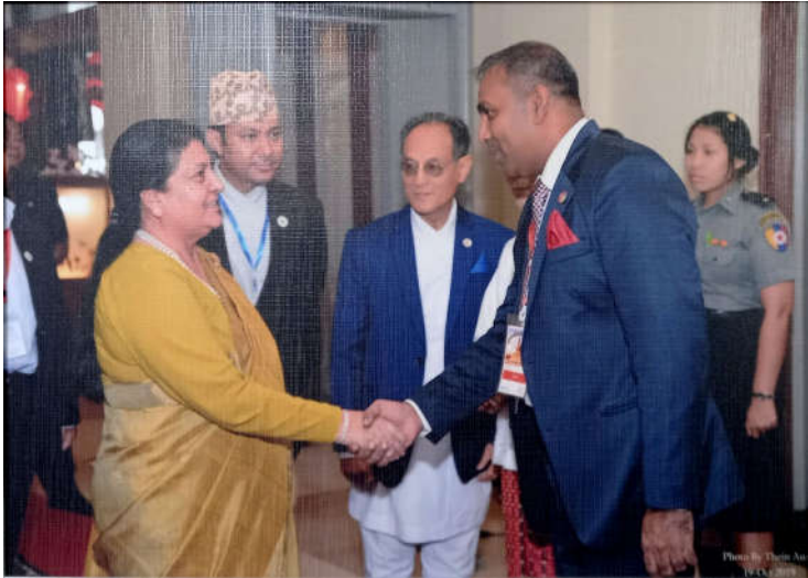
Greeting with President of Nepal, Mrs. Bidhya Devi Bhandari