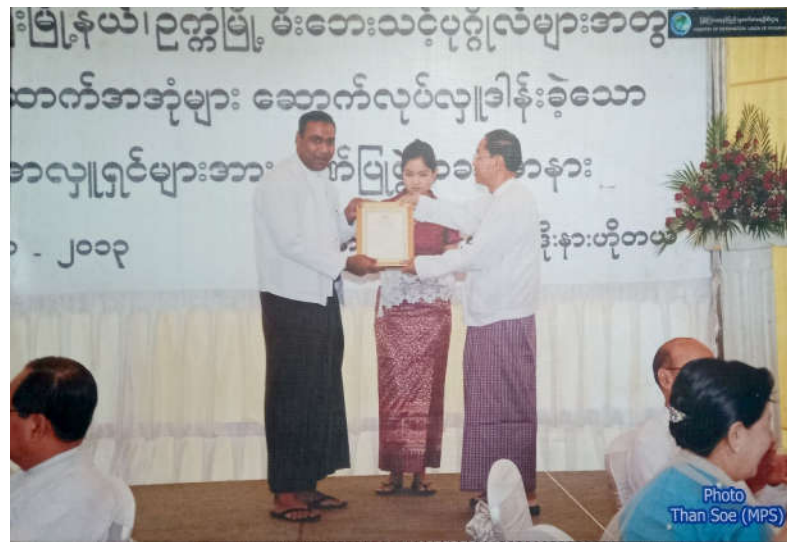
Vice President of Myanmar U Myint Swe